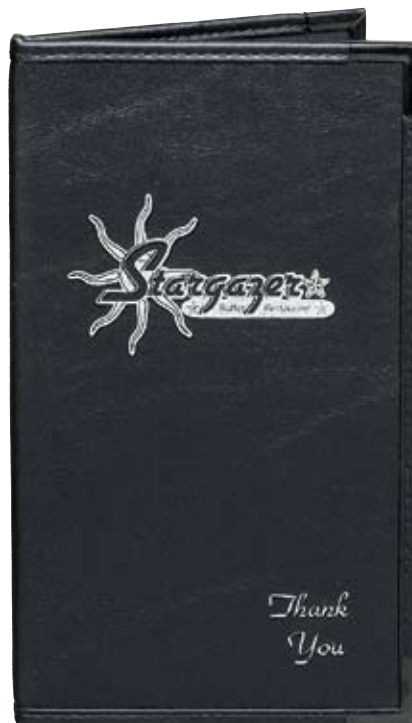
Black Royal Style